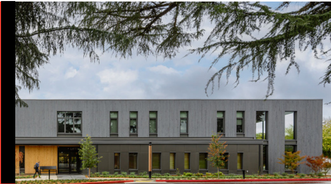
Life Skills Training Center, WA State School for the Blind Mahlum Architects