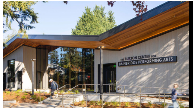
The Buxton Center for Bainbridge Performing Arts LMN Architects