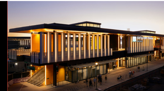
Seattle Ferry Terminal NBBJ