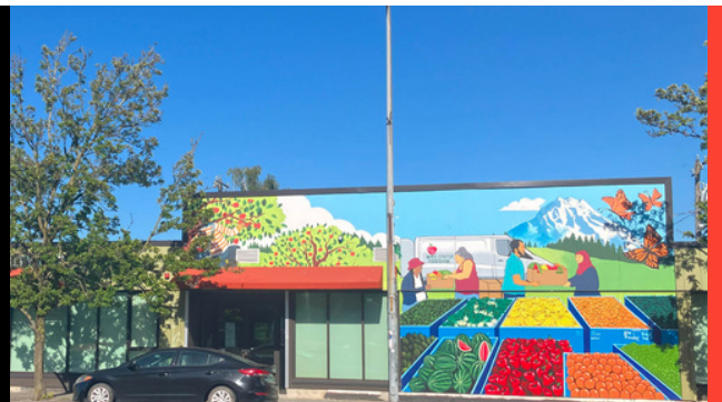
White Center Food Bank Side x Side Architects