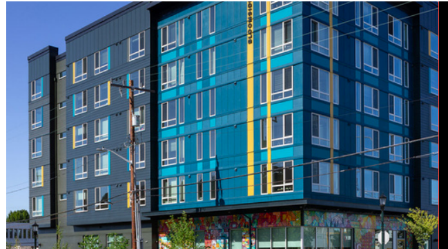
Bloomside SMR Architects